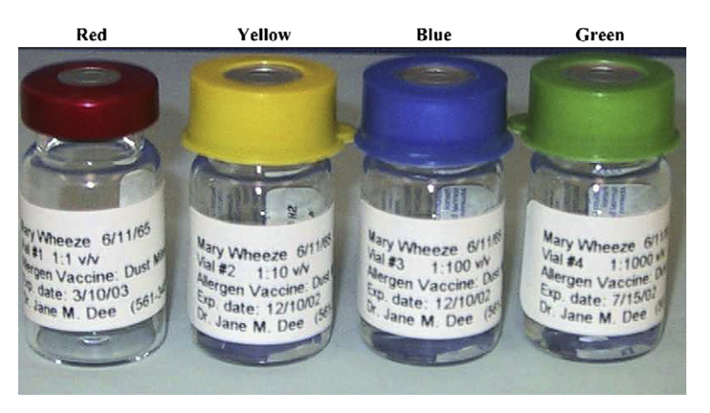
FIG 2. Example of color-coded vials of allergen immunotherapy maintenance.